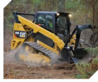
Compact Track Loaders