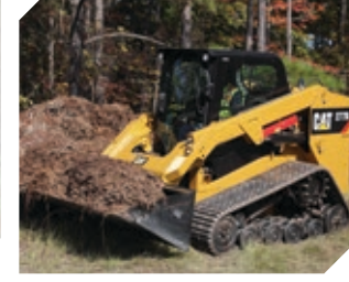
Multi Terrain Loaders