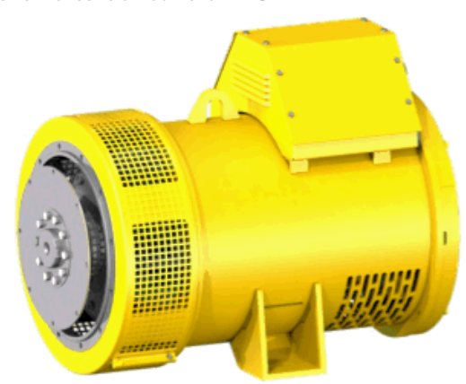
Figure 1: PMG-I Alternator

In terms of excitation for brushless-type alternators, a distinction has been drawn in the past between PMG and non-PMG alternators. For Cat generator sets produced by PSB, the standard alternator features an auxiliary coil (or auxiliary winding) and magnets in the main exciter stator. This excitation system has been called PMG-I (PMG-Initiated), due to its similar performance to a traditional PMG.