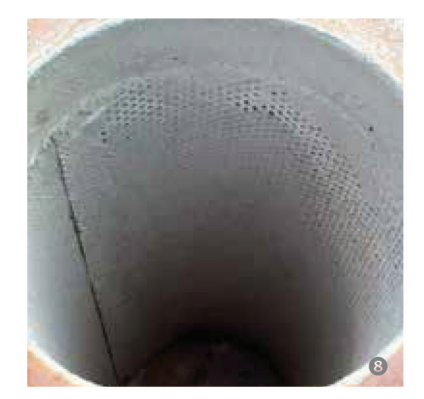
Inside of a muffler with siloxane residue