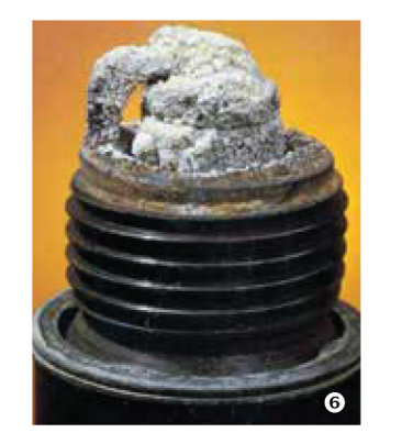
Spark plug contaminated with siloxanes

In some cases, it may be more attractive to owners to defer on the installation costs associated with advanced fuel treatment systems, and accept the operating costs associated with shorter maintenance and overhaul intervals. This 'pay me now or pay me later' dilemma is often decided based on a developer's assessment of risk and reward.